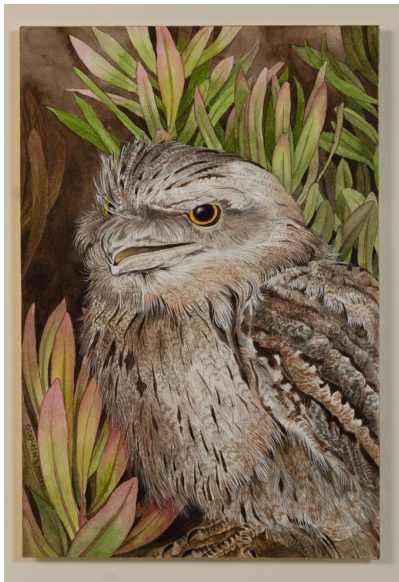
Tawny Frogmouth Watercolour 26 x 16cm | $800