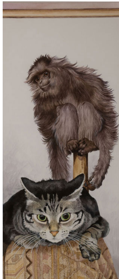
Raphael suspects there's a monkey perched behind him Watercolour 55 x 22cm | $1,800