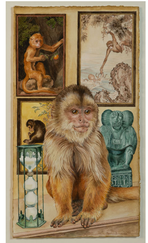
Monkey's timeless magic Watercolour 42 x 23cm | $1,400