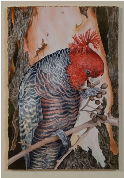
Gang Gang Watercolour 26 x 16cm | $800