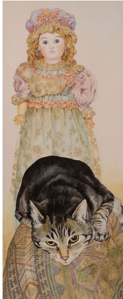
Somebody left a doll behind in 1880 Watercolour 54.5 x 22cm | $1,800