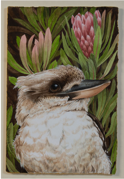
Kookaburra Watercolour 26 x 16cm | $800