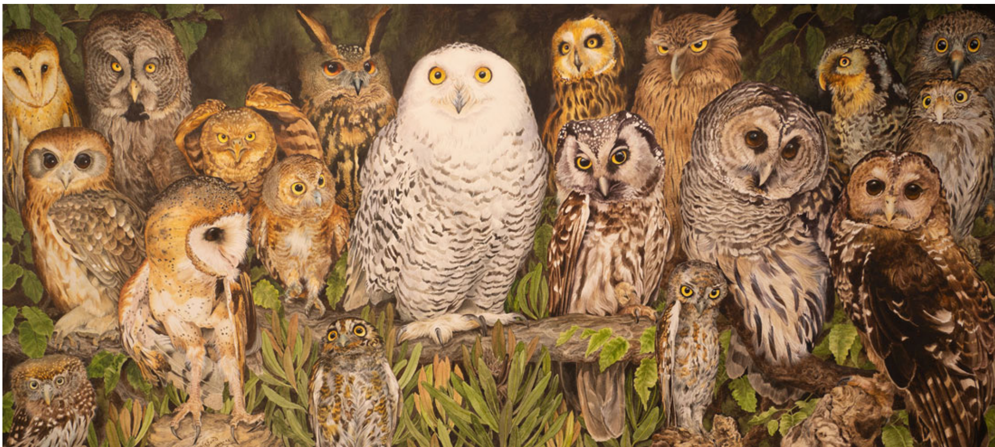
Parliament of Owls Watercolour 45.5 x 145cm | $6,800