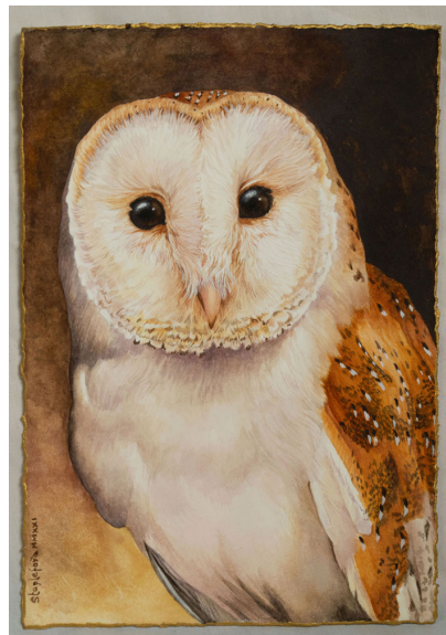
Barn Owl Watercolour 25 x 17.5cm | $700