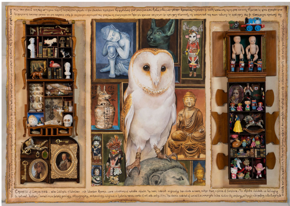
Owl and the cabinets of curiosity Mixed media and watercolour 43 x 61 cm | $3,200