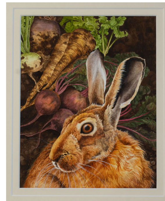
Hare's harvest Watercolour 25 x 19.5cm | $900