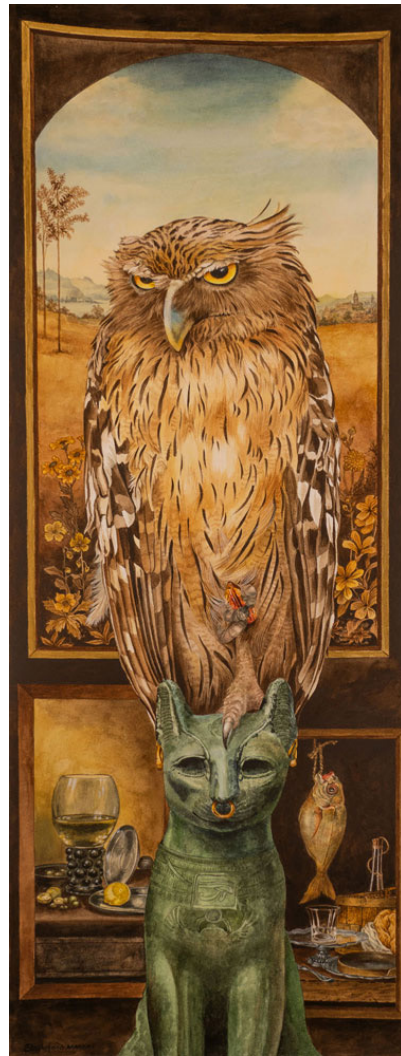
Fishing Owl. The Curator of the Museum at the end of time Watercolour 76 x 26cm | $2,300