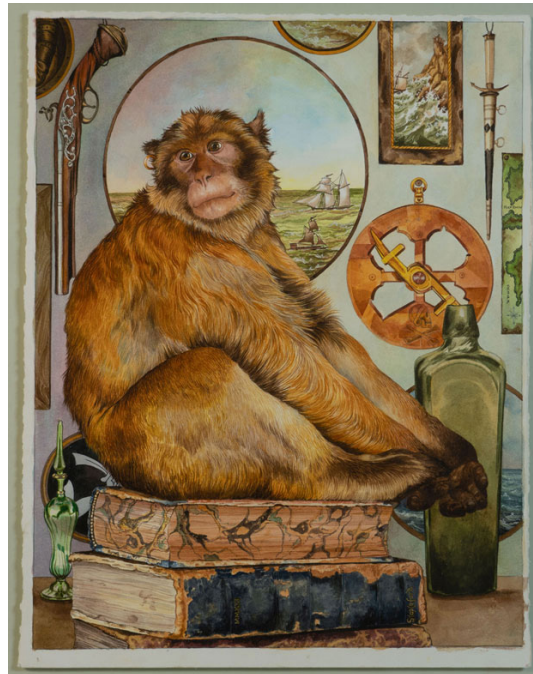
The pirate's monkey Watercolour 44 x 34.5cm | $1,800