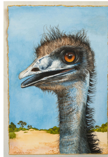
Emu Watercolour 25 x 17.5cm | $800