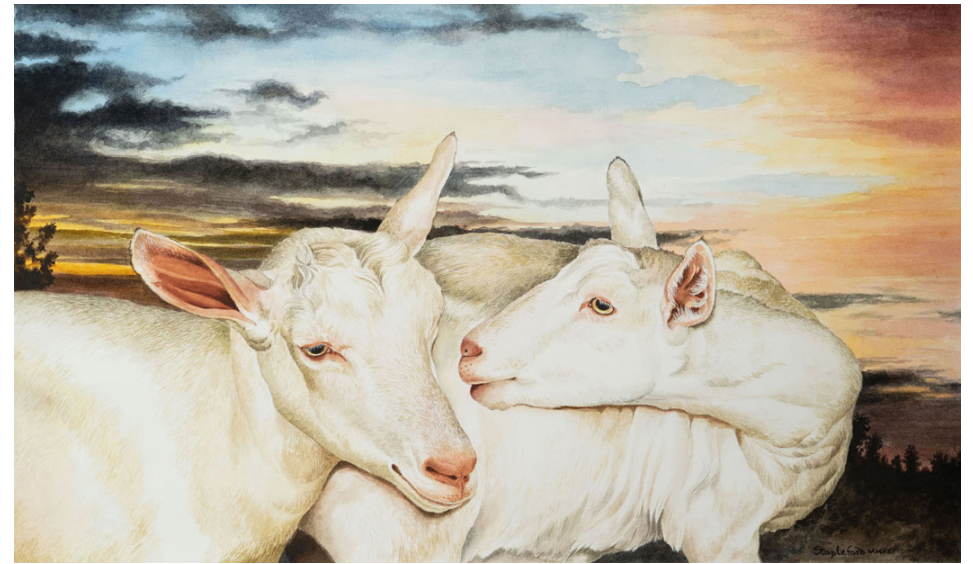
Sunset on the mountain Watercolour 25 x 42.5cm | $1,500