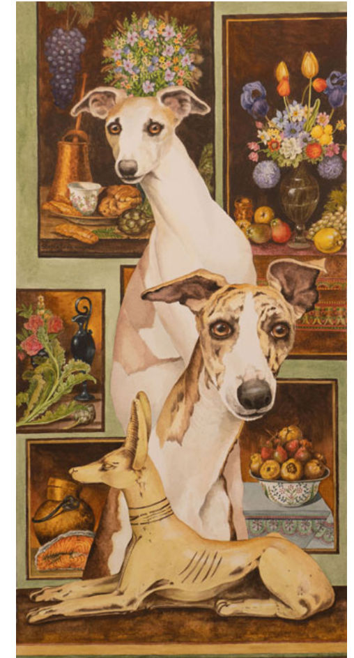
The bone dog Watercolour 55 x 27.5cm | $2,200