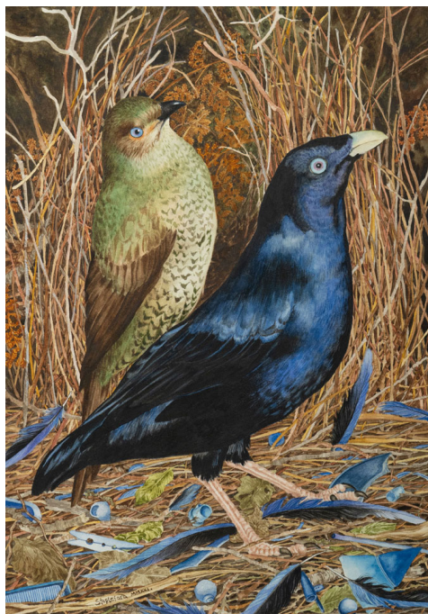
Bowerbirds Watercolour 39 x 27.5cm | $1,600