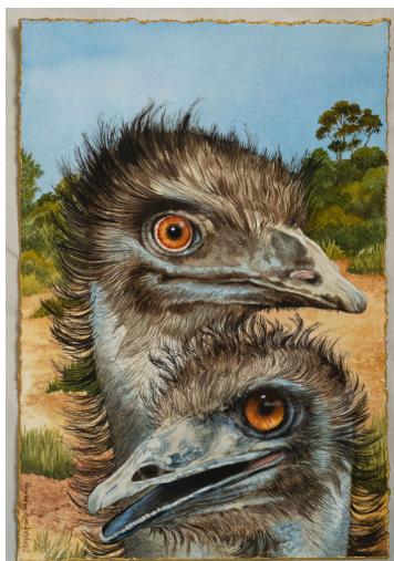
In the eye of the Emu Watercolour 25 x 17.5cm | $800