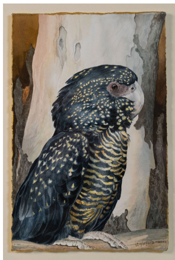
Red tailed Cockatoo Watercolour 26 x 16cm | $800