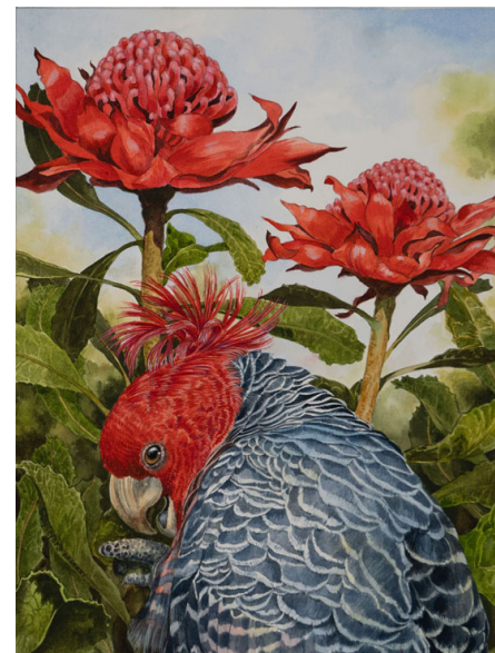
The colour red Watercolour 30 x 22.5cm | $1,400