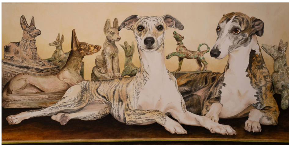
Ancient history Watercolour 38 x 76cm | $3,600