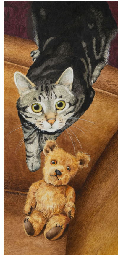
Who is that sitting in my chair? Watercolour 44 x 20cm | $1,400