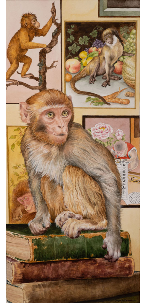
The monkey room Watercolour 54 x 24cm | $1,800