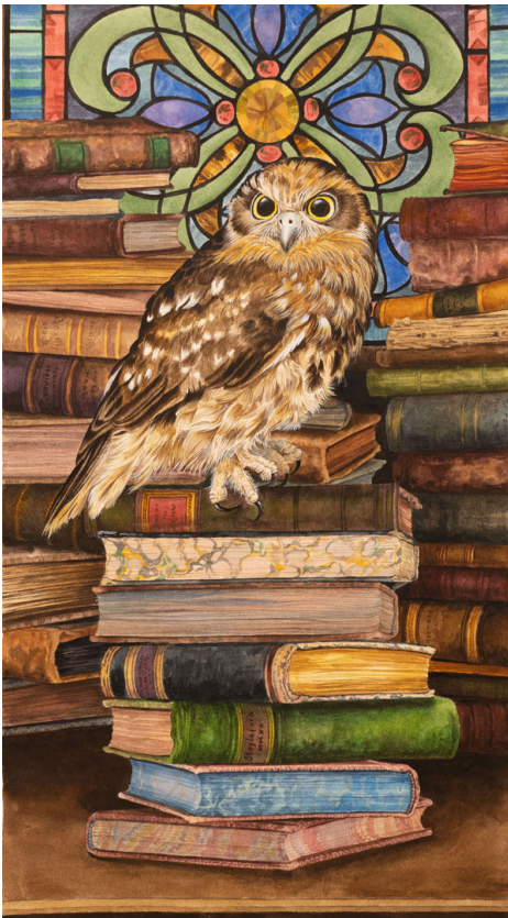
Discovering the Library Watercolour 46 x 25cm | $1,500