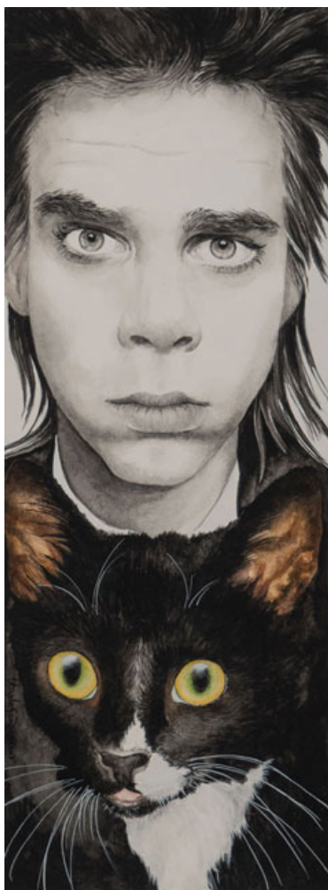
Black hair - a song by Nick Cave Watercolour 40 x 15cm | $1,300