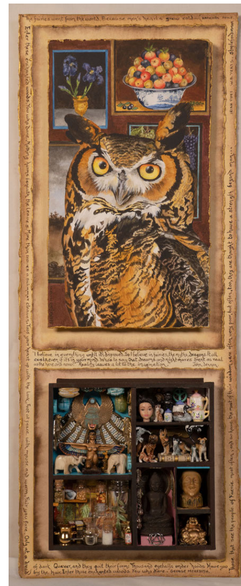
Owl's curiosity collection Mixed media and watercolour 56 x 22cm | $2,000