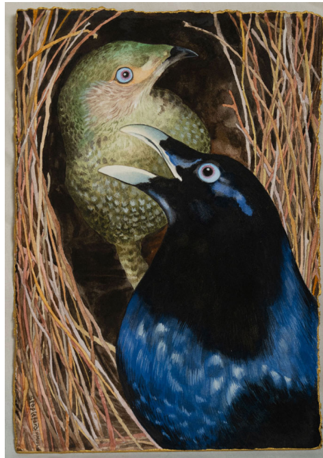
Bower birds Watercolour 39 x 27.5cm | $1,700