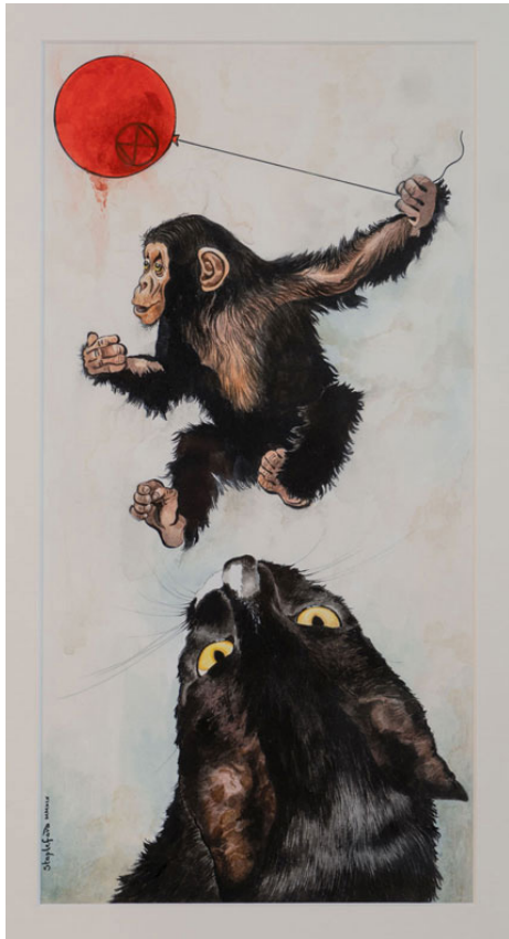
Is that a Banksy flying by? Watercolour 40.5 x 20.5cm | $1,200