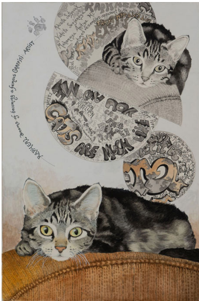
Rapahel dreams of becoming a famous graffiti artist Watercolour 34 x 22.5cm | $1,100