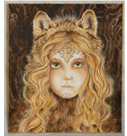
Elfin child Watercolour 19 x 16.5cm | $500