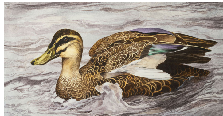
Blackheath duck pond Watercolour 19 x 36cm | $1,300