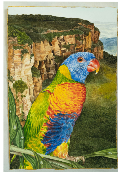
Top of the mountain Watercolour 25 x 17.5cm | $800