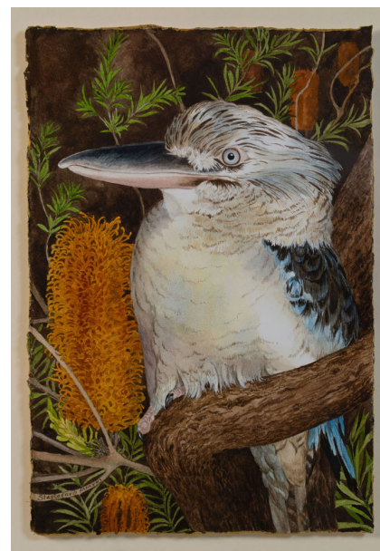
Blue-winged Kookaburra Watercolour 26 x 16cm | $800